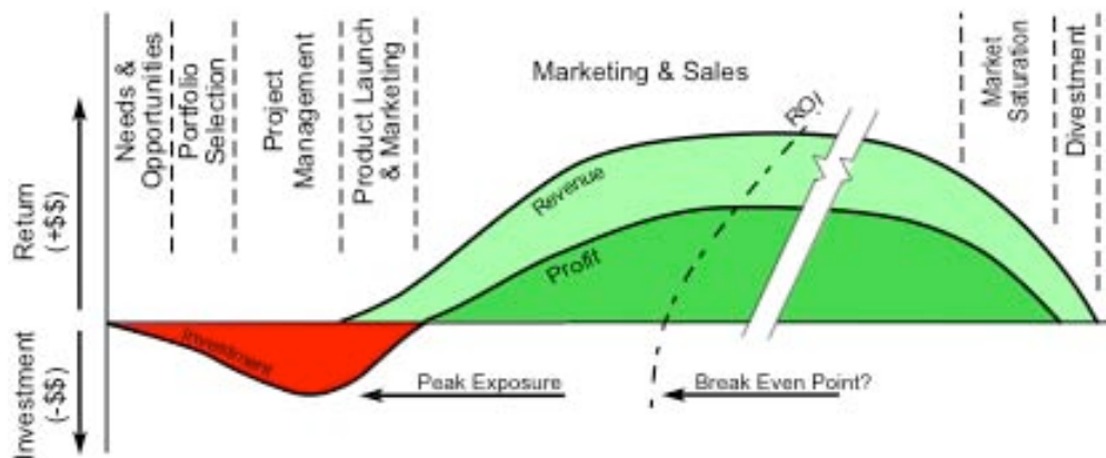
Figure 4: Product life span cash flow

Figure 4 illustrates the impact of a successful project portfolio in terms of future corporate cash flow.