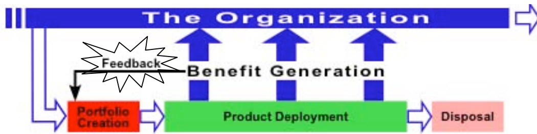
Figure 3: Completing the project portfolio life span

shows the fourth and fifth phases of the PPLS, the return of benefits to the organization and the key element of feedback of benefits information to the portfolio management function.