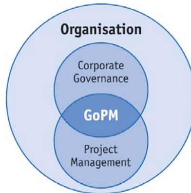
Figure 1: Governance of project management (GoPM)

total corporate governance and, by the same token, only a small part of project management. However, it does emphasize that GoPM should not interfere with "most of the methodologies and activities involved with the day-to-day management of individual projects." 7