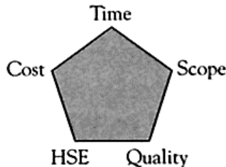
Figure 2: Five Criteria for Project management Success

However, the authors go further and suggest that a fifth criterion should be added, namely: ". . . safety. For projects in which people's safety is at risk or the project poses a potential hazard to the environment, external standards are normally imposed for health, safety, and environmental reasons (HSE). [See Figure 2]" 14