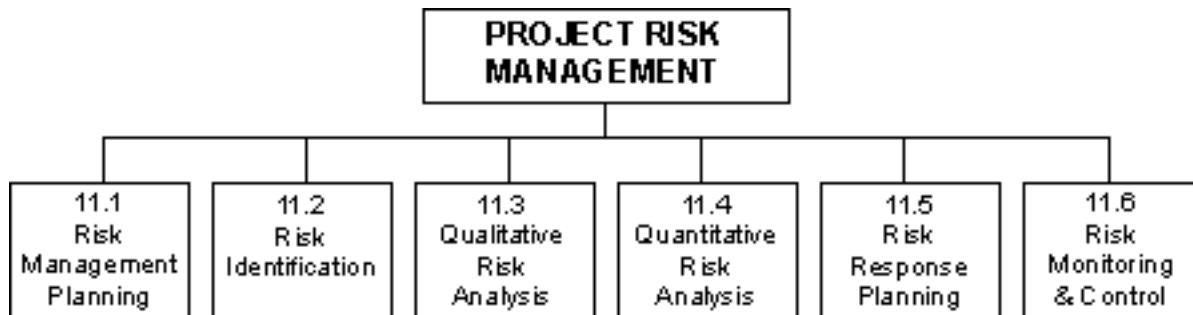
Figure 2: PMI's Project Risk Management Overview

to sell to the owner, although most of his experience is from the seller's perspective. The inference is that detailed project risk management activities take place within the seller organizations although both buyer and seller have responsibilities. Still, it is worth pausing for a moment to compare this figure with the Project Management Institute's view shown in Figure 2. 20