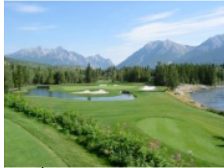
4 th hole Mt. Kidd Course