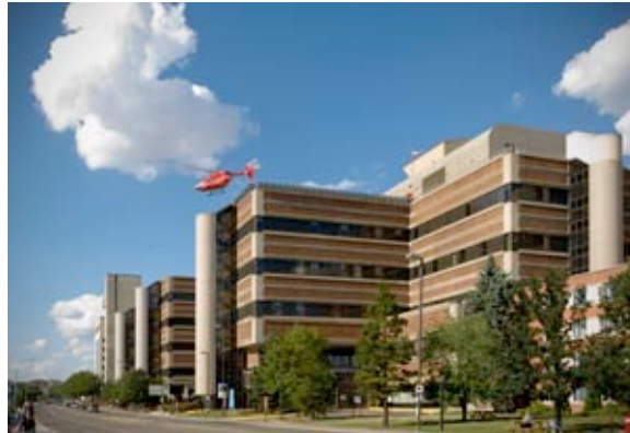
Walter C Mackenzie Health Sciences Centre